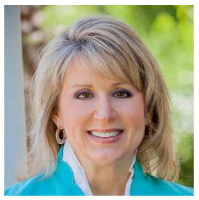
US Rep. Renee Ellmers